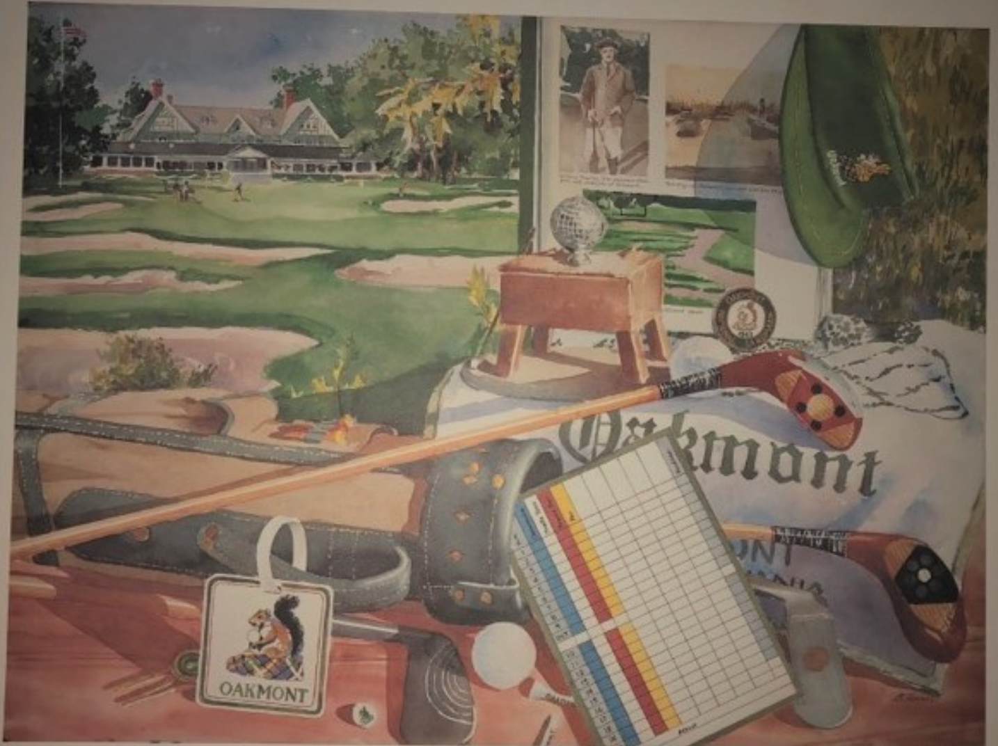
"Another Major at Oakmont"