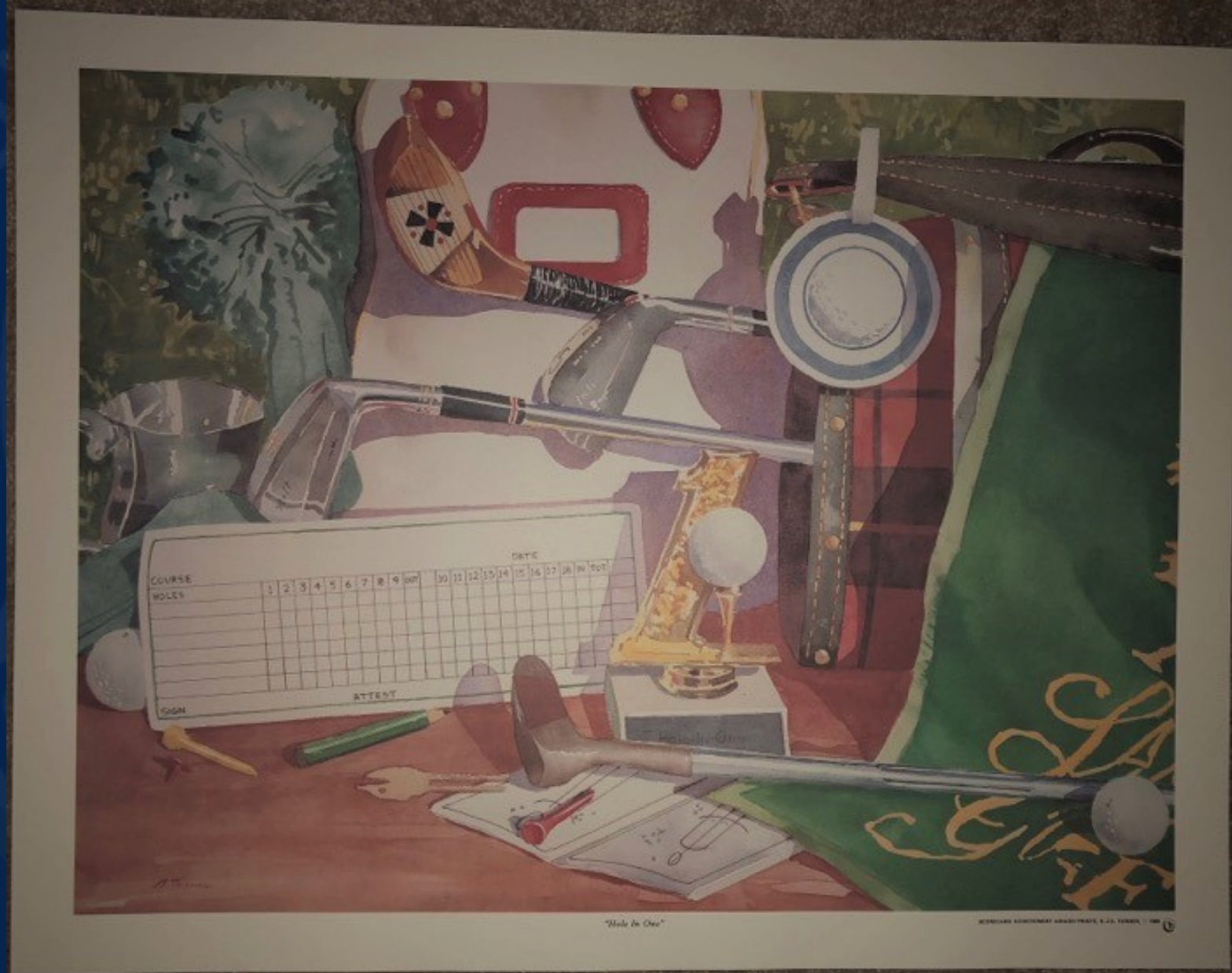
"Hole In One"

WESTERN ARTISTS ASSOCIATION, S.F. CALIF. 1988