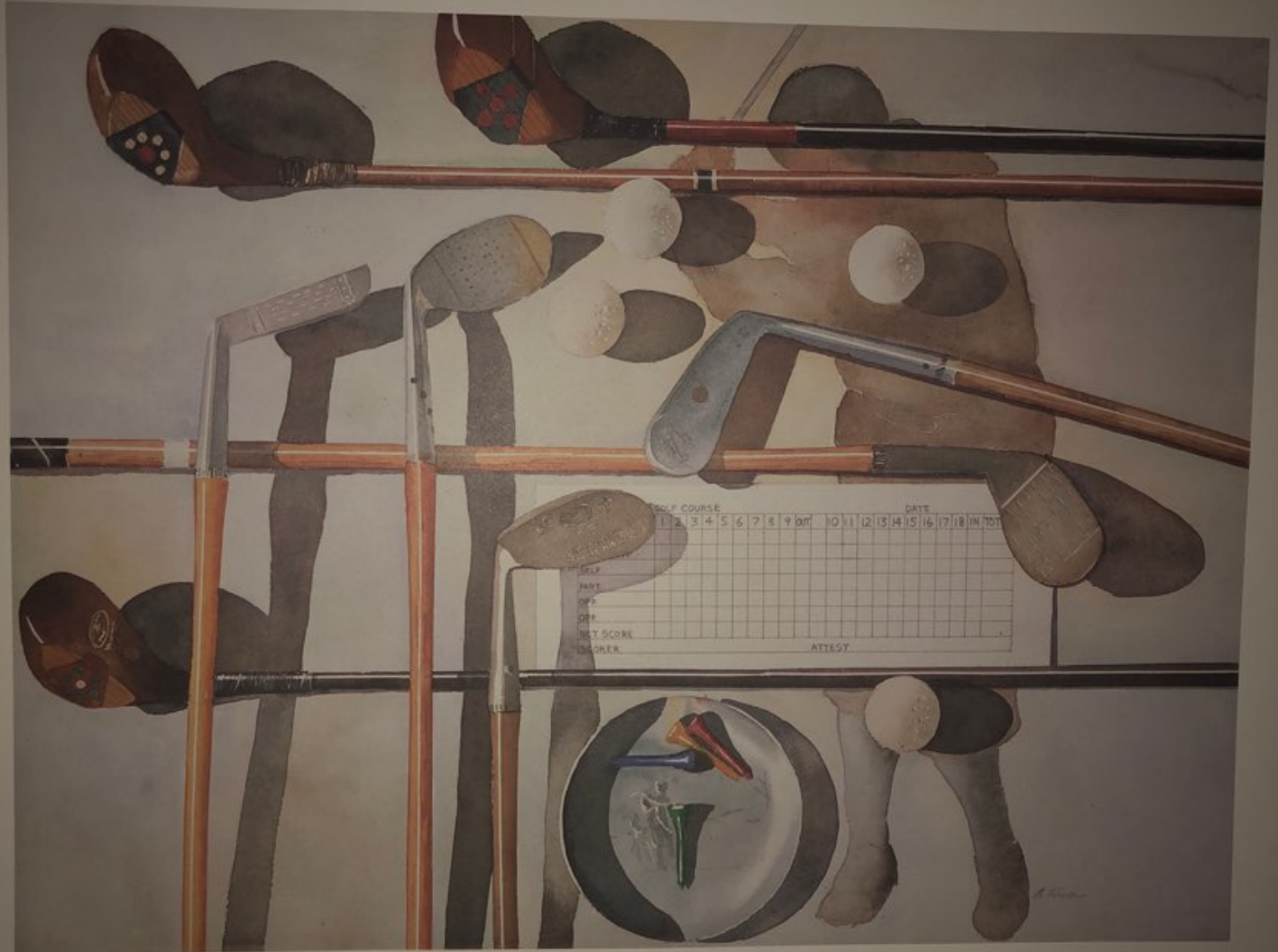
"In the Tradition"