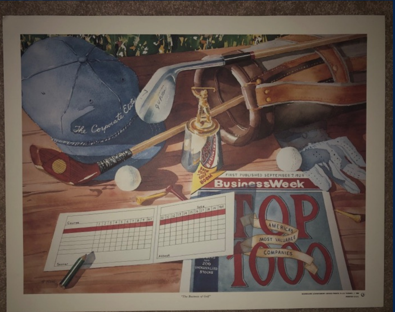
"The Business of Golf"